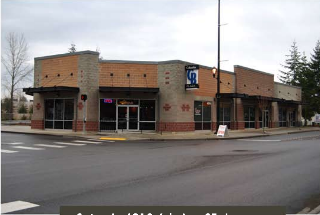
Suite A, 4219 6th Ave SE, Lacey

Fully Built-Out and Equipped Coffee House, Wine Bar and Cafe`