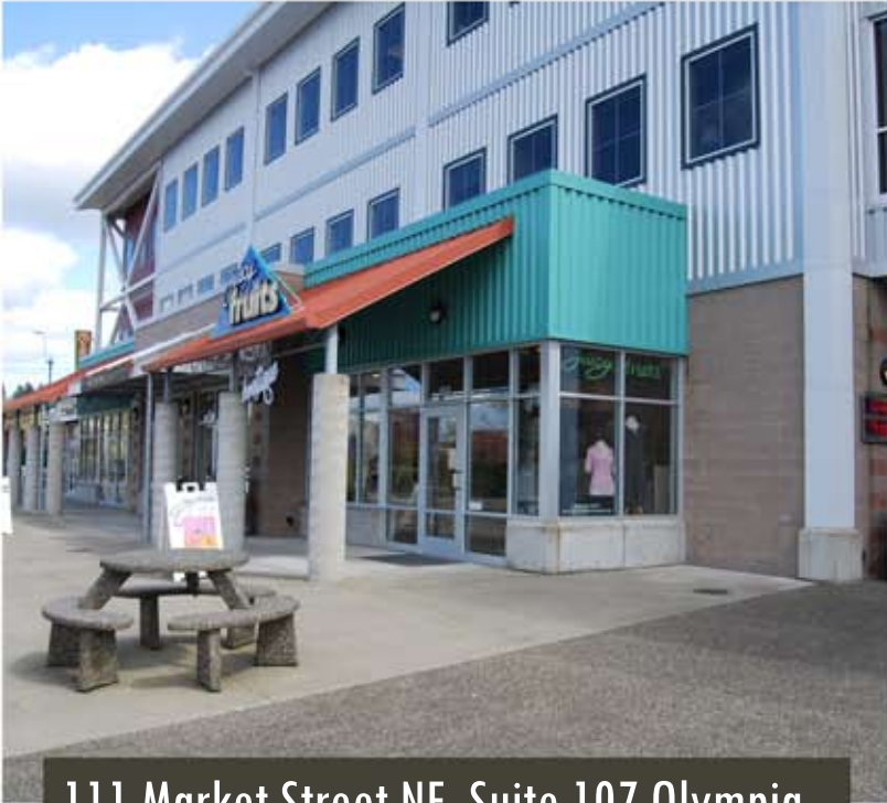
111 Market Street NE, Suite 107 Olympia