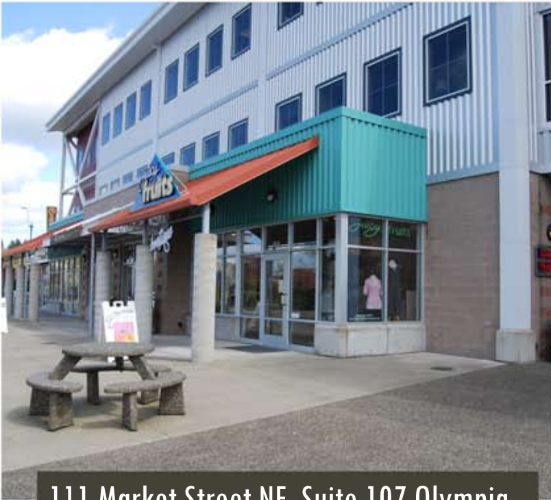
111 Market Street NE, Suite 107 Olympia