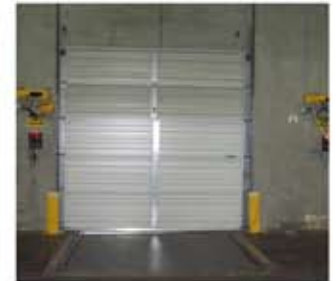
2670 Crites Street SW Tumwater, WA